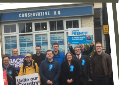
17,353 people voted for Louie French in the December 2019 General Election.